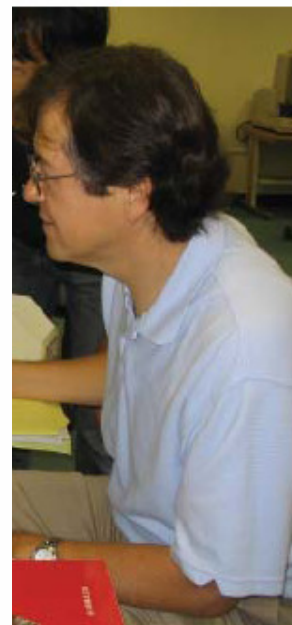
onoa researching at the Room.

Japan and are now available for your research (microfilm S11519, S11520, S11523-S11525). (Tokiko Bazzell)