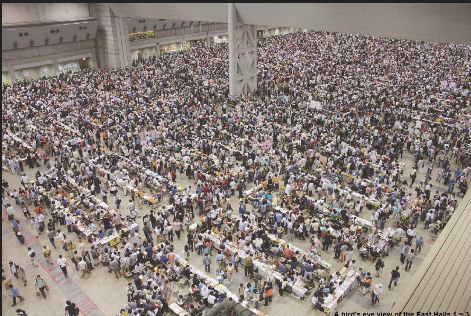
A bird's eye view of the East Halls 1 ~ 3.