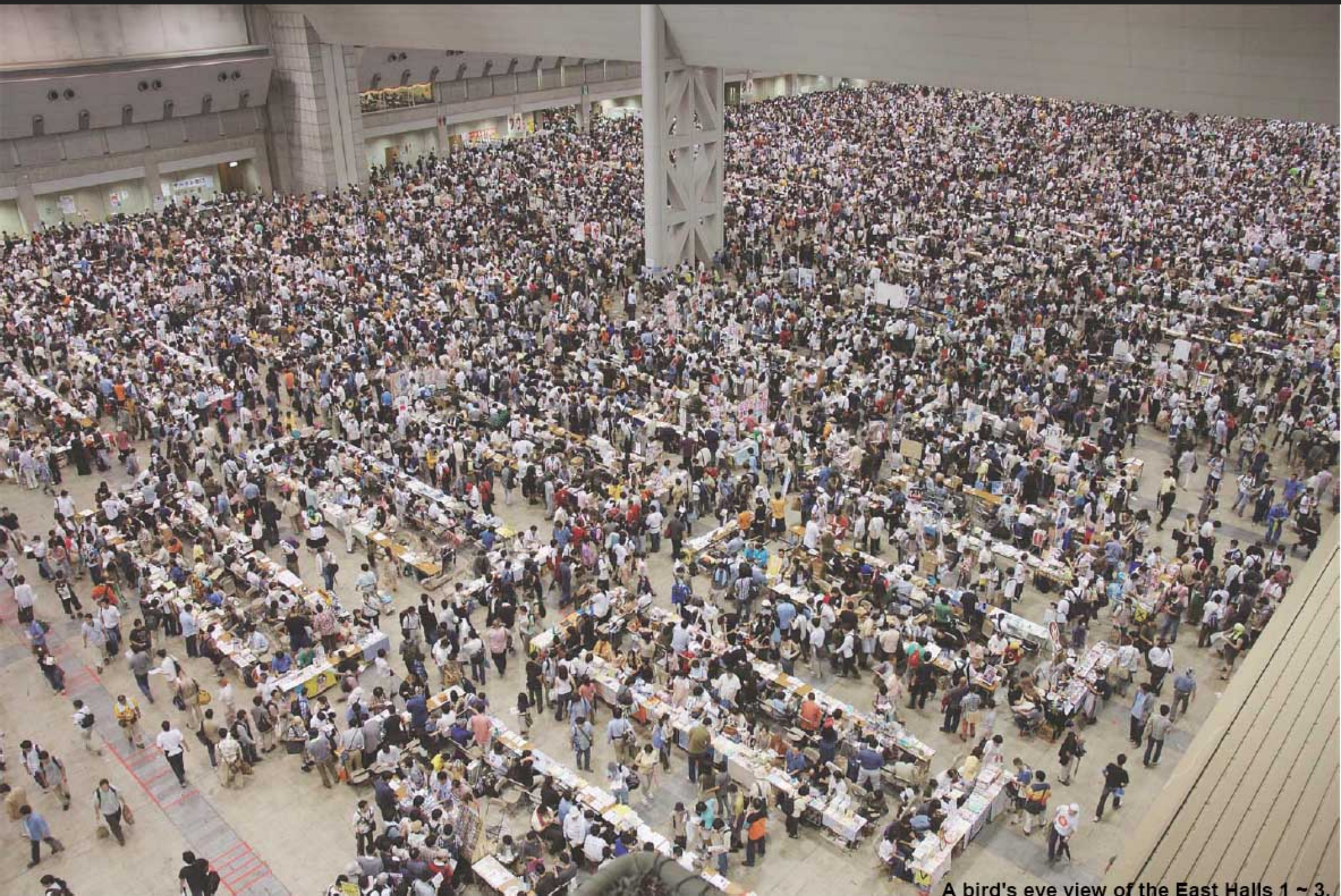
A bird's eye view of the East Halls 1 ~ 3.